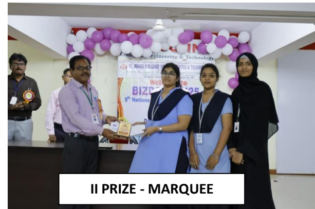
II PRIZE - MARQUEE