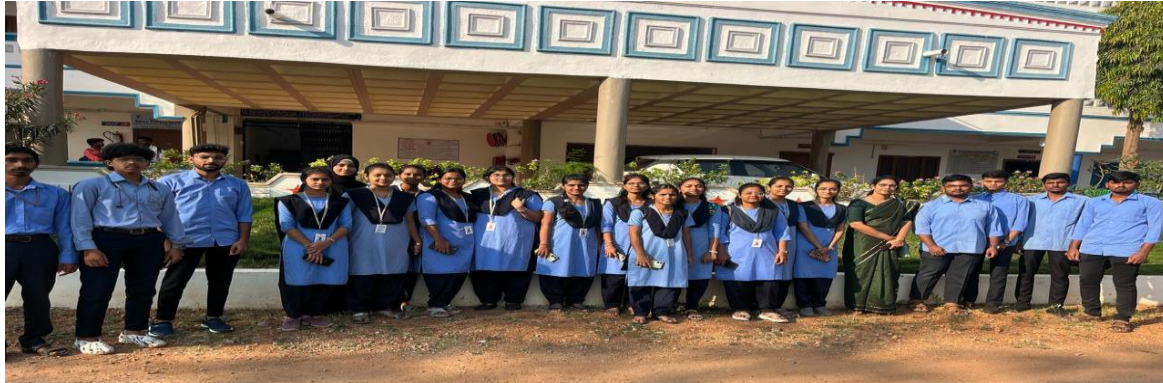
Winners of the Event