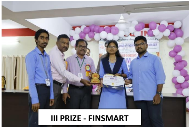
III PRIZE - FINSMART