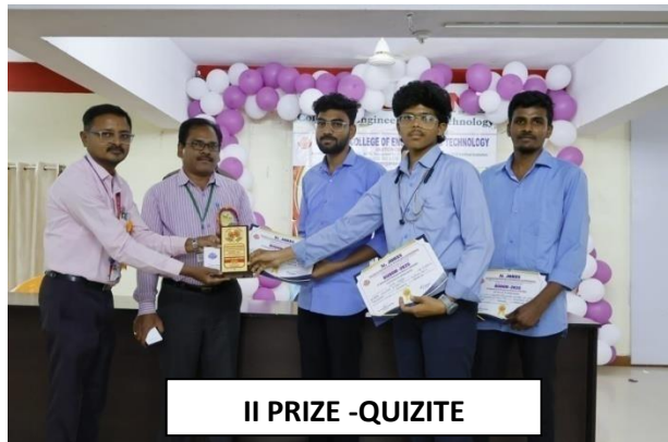
II PRIZE - QUIZITE