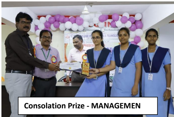
Consolation Prize - MANAGEMEN